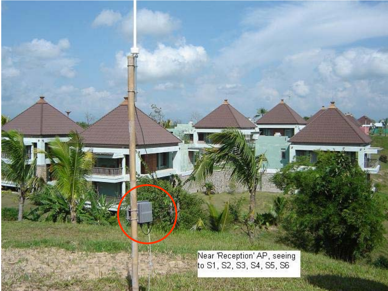
Near 'Reception' AP, seeing to S1, S2, S3, S4, S5, S6